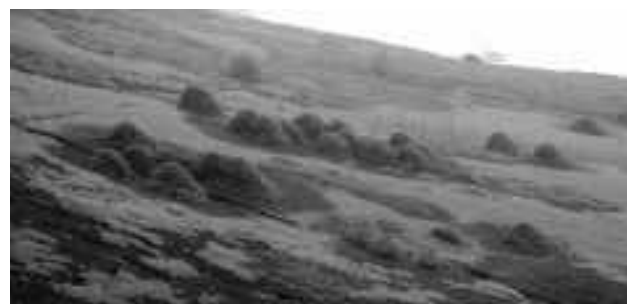
Fig. 3 Allelopathic halos of dead Cyperus atlanticus within the reach of root systems of the mistakenly introduced tree Syzygium cumini .

The beetle, Liagonum beckeri , is almost certainly the world's most extreme example of narrow endemism. The population is restricted to a wet rock of <1 m 2 , inside a deep ravine. About 20 individuals of this beetle are visible