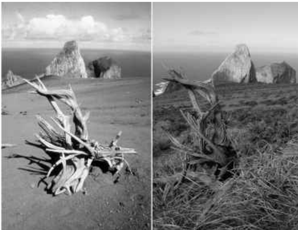
Fig. 2 A ridge on Trindade Island in 1995, when hundreds of feral goats degraded the vegetation and impeded recovery (left) and the same area in 2009, five years after feral goat eradication. The herbaceous layer is composed mainly of the two endemic sedges Cyperus atlanticus and Bulbostylis nesiotis , and the widespread fern Pityrogramma calomelanos .

Areas kept barren by feral goats up to the 1990s are currently being colonised by herbaceous vegetation (Fig. 2). The chief pioneer species in this process are the endemic sedges Cyperus atlanticus and Bulbostylis nesiotis , followed by the fern Pityrogramma calomelanos (Alves and Martins 2004; Martins and Alves 2007).