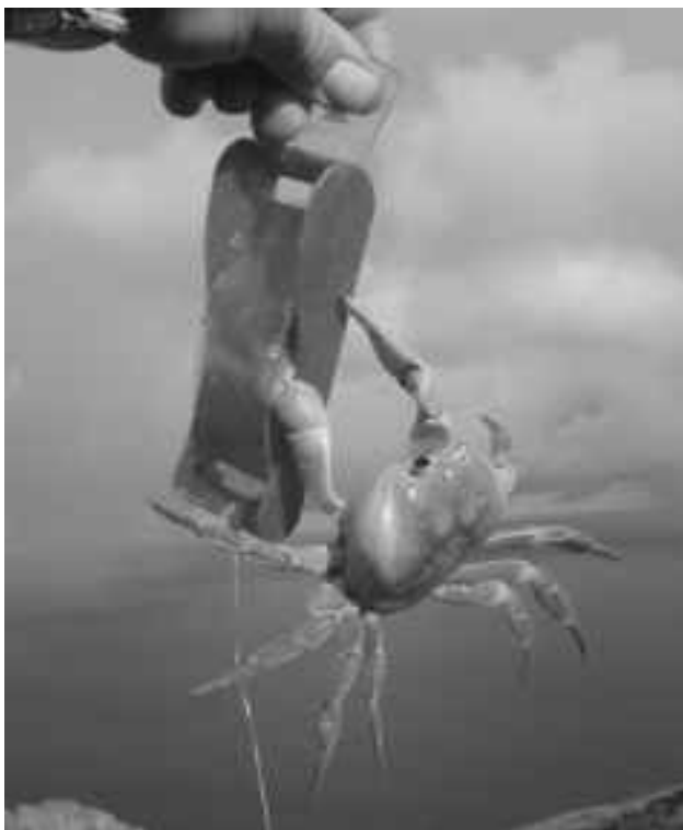
Fig. 4 The land crabs ( Gecarcinus lagostoma ) consumed most of the bait during preliminary field trapping in February 2010.