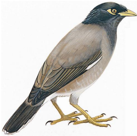
Common myna ( Acridotheres tristis ).

Common mynas are 25 cm in length, medium sized but heavily built with predominantly brown plumage. The head and breast are glossy black and the undertail coverts and tip of the tail are white (Feare et al. , 1999). The bill, legs and feet and a bare patch of skin around the eyes is yellow (Feare et al. , 1999). Common mynas are aggressive and said to be highly competitive. Less information is available for the jungle myna which is often mistaken for common myna. Watling (1975) concluded that the two species fill different places in habitats modified by man but share a wide ecological overlap.