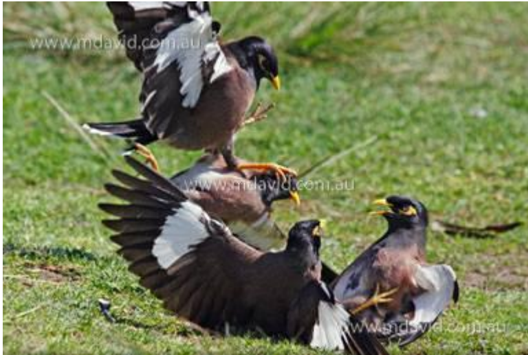
Figure 3 Fighting behaviour display involving four mynas in a park in Sydney, Australia.

Common mynas also show ‘mobbing’ behaviour against black backed gulls, red-billed gulls, cats and humans that come near nests occupied by mynas (Counsilman, 1974a). The high degree of intolerance shown by mynas to other birds nesting in their vicinity may lead to disruption of successful breeding by native birds.