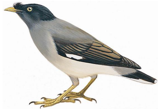
Jungle myna ( Acridotheres fuscus) a smaller (about 75%) and more secretive bird than the common myna. Little is known of the jungle myna.