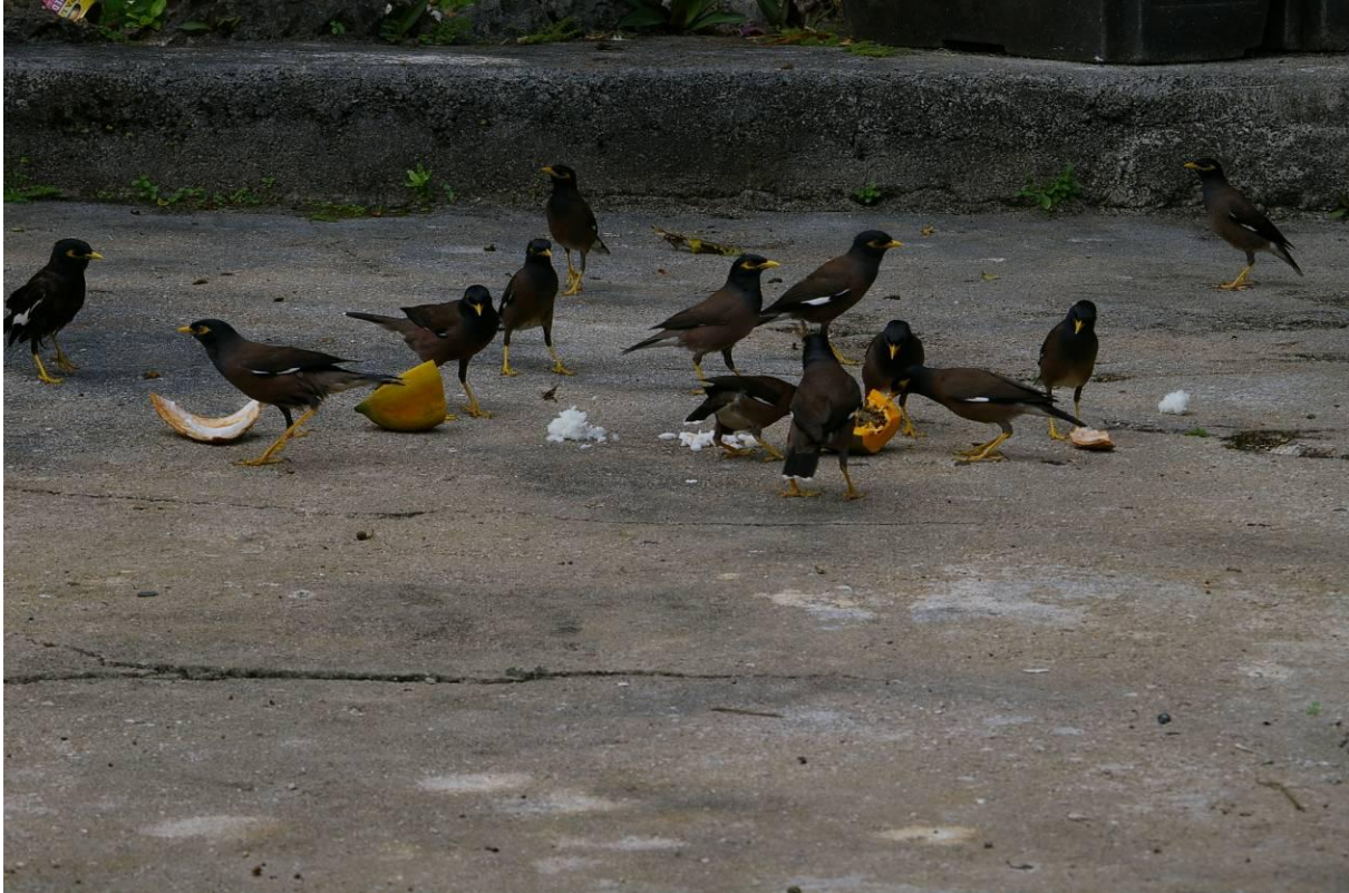
Common mynas ( Acridotheres tristis) showing preference for pawpaw ( Carica papaya) over fresh coconut and boiled white rice, Mangaia, Cook Islands.