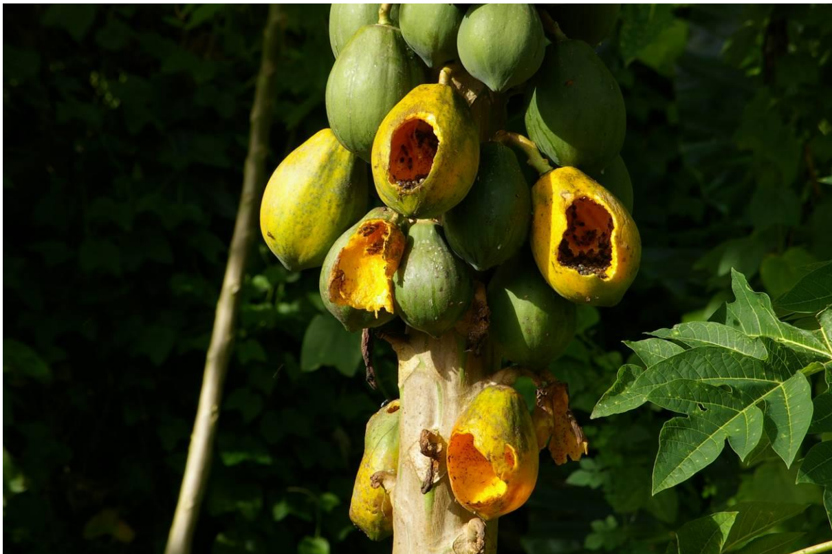
Common myna ( Acridotheres tristis ) damage to pawpaw ( Carica papaya ), Mangaia, Cook Islands.