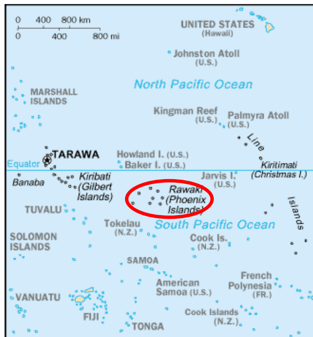
Map 1. Location of the Phoenix Islands.

Note: Land areas are total atoll area minus lagoon area.